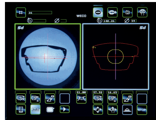
Optical Trace Functionality