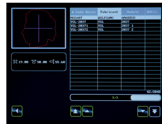
Large Database for Jobs and Shapes